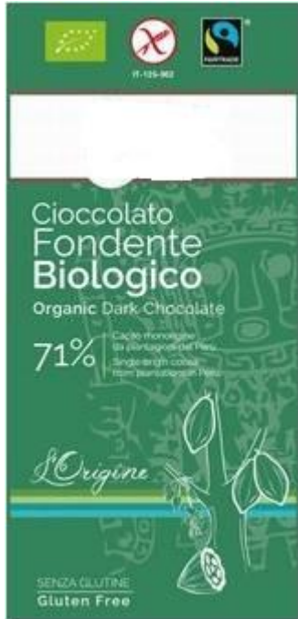
ORGANIC BITTER CHOCOLATE