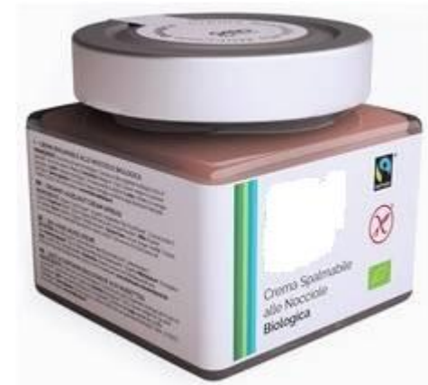
GLUTEN FREE ORGANIC HAZELNUT SPREAD 200 gr